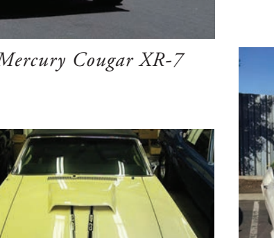
Tom Wood's 1969 Mercury Cougar Convertible