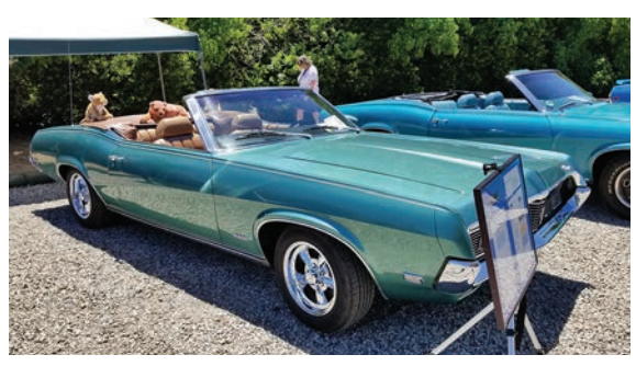
Robert Cummings' Dark Aqua 1969 Mercury Cougar XR-7 Convertible