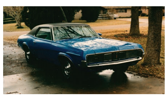
Conan Tigard's 1969 Mercury Cougar