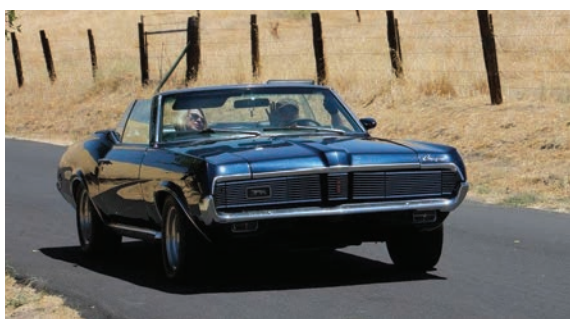
Juli Oatham's 1969 Mercury Cougar XR-7 Convertible