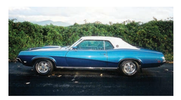
Tom Wood's 1969 Mercury Cougar XR-7